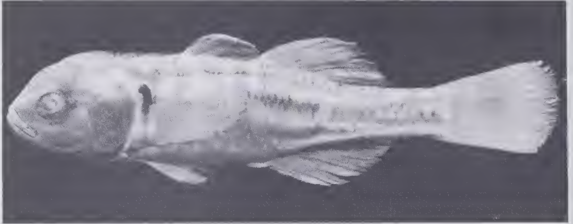
Figure 3 Hypseleotris aurea , male, 36 mm SL, Murchison River, Western Australia.

anteriorly and dorsally, often fading on caudal peduncle. A small dusky spot at base of caudal rays below midside. Second dorsal with 2 or 3 rows of small dark spots on basal half of fin, surrounding white to clear spots. Distal tip of fin dusky, sometimes whole fin dusky. Extreme tip of anal usually white.